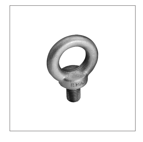
Lifting eye bolt